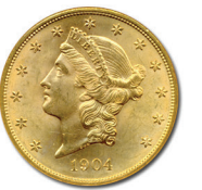
1904 $20 Liberty