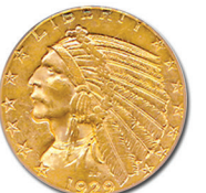
1929 $5 Indian